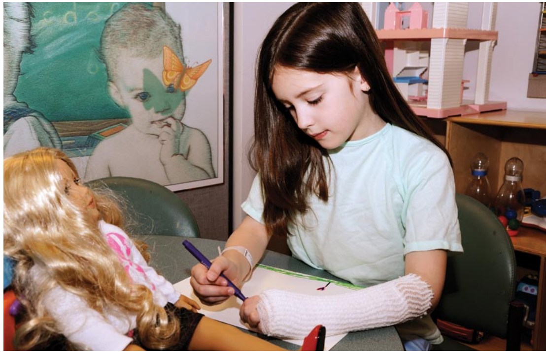
A dedicated playroom for pediatric burn patients is located within the Burn Center, providing access to play and activity around the clock.