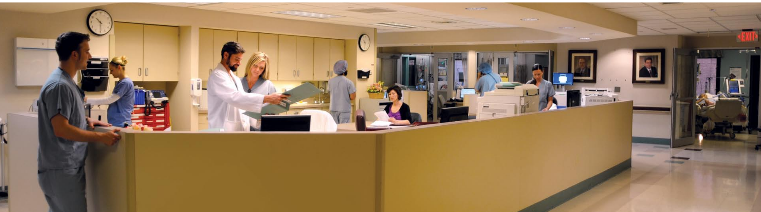
State-of-the-art burn center